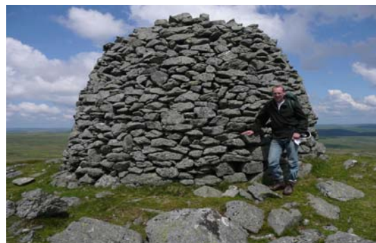
Summit "Beehive" Cairn